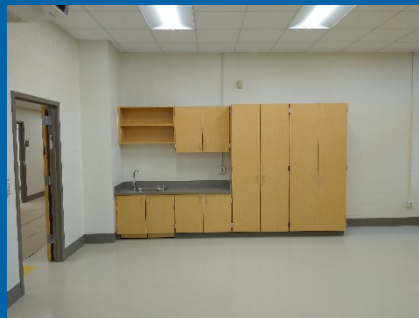
Finish Install of Casework in Classrooms at Building 2010