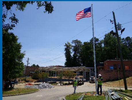
Set Flagpole and Flagpole Sleeve