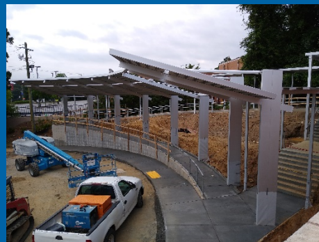
Complete Install of Canopy at ADA Ramp & Finish Ramp and Sidewalk