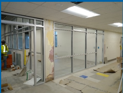
Install Storefront System and Glass at Entry