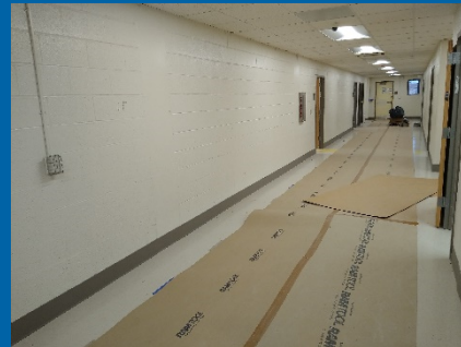
Continue Install of VCT at Building 2010