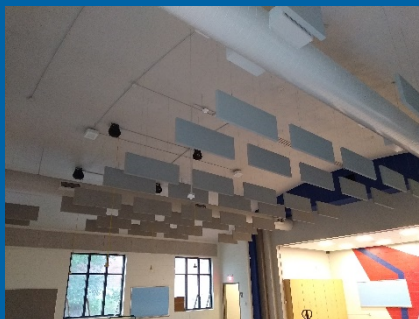
Hang Acoustical Baffles in STEM Lab